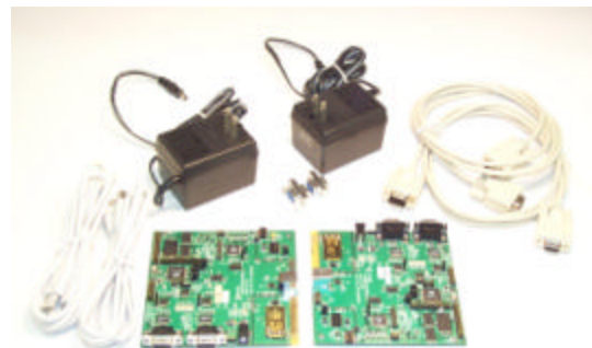
QuickConnect BTE Reference Set

Widcomm Inc. 9645 Scranton Road Suite 205 San Diego, CA 92121 858-453-8400 (phone) 858-453-5735 (fax) www.widcomm.com info@widcomm.com